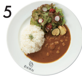
5 Beef curry (medium-spicy) 1650

wheat • milk • beef • chicken • pork • soy • banana • apple