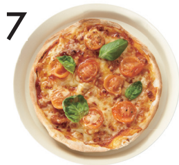
7 Margherita pizza 1650