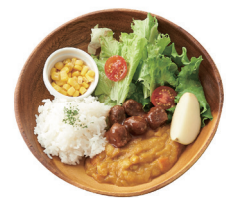
Kids plate 1320