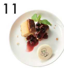
11 Castella florentine 660