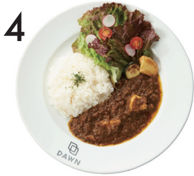
4 Spice chicken curry (Hot) 1650