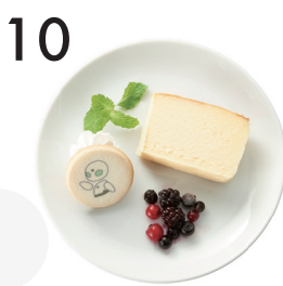
10 Creamcheesecake 660

milk • soy • wheat • egg almond • walnut • gelatin