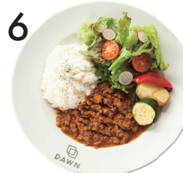
6 Vegetable keema curry (medium-spicy) 1650

wheat • milk • beef • chicken • pork • soy • banana • apple