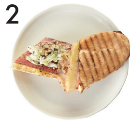
2 Bacon, cabbage, cheese 800