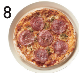
8 Pepperoni pizza 1650