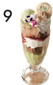
9 Pistachio and chocolate parfait 1800

milk • soy • wheat • egg almond • walnut • gelatin