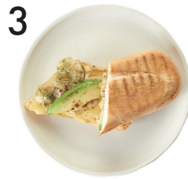
3 Shrimp, avocado 800